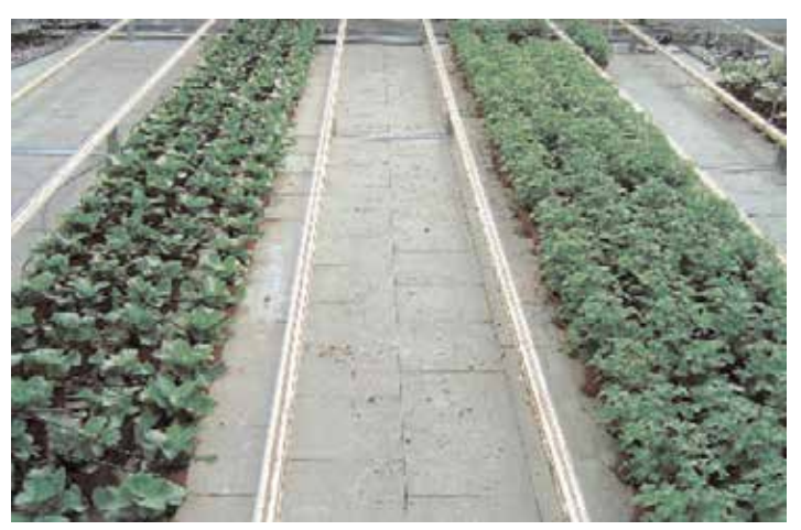
No shadows with HD Soft White